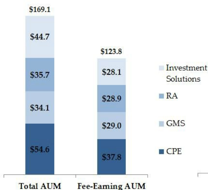
Assets Under Management ($ billion)